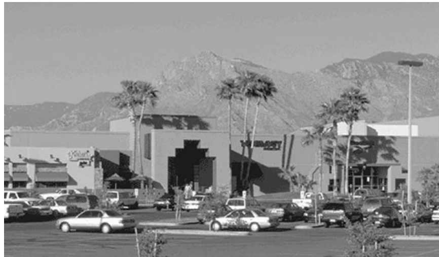
Figure 4: Foothills Mall, Tucson, AZ