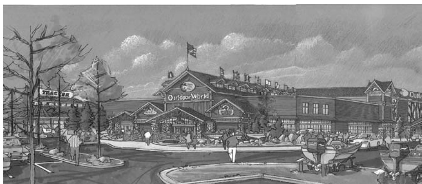
Figure 2: The Bass Pro store at the Harrisburg Mall

The purchase price, including buildings and land, was $17.5m or $20.88 per square foot. The following is a summary of the Harrisburg Mall transaction.