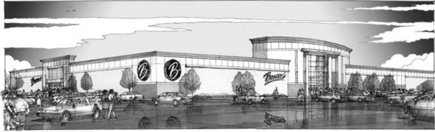
Figure 3: The Boscov's store at the Harrisburg Mall